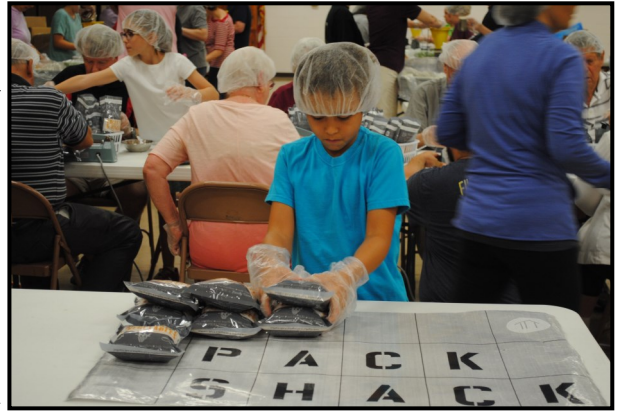
From a Pack Shack event in 2019.

As stated in our article about Work Camp, one of the organizations we worked with for Work Camp and will be working with again on July 26 is Kids Around the World . If you have participated in a meal-packing event with us in the past through the Pack Shack, you may be familiar with what this looks like. The Pack Shack in Ohio has since closed due to the pandemic, but the staff we have partnered with in the past now work through an organization called Kids Around The World. Their Ohio office is located out of Dayton, and they have graciously offered to come to us so both our high school group and our Explorations group can have this experience at our church! This means that we will be able to work on the project at the church, then hand deliver what we packed to local pantries the next day! Our high school students did just that during our Work Camp week on June 22.